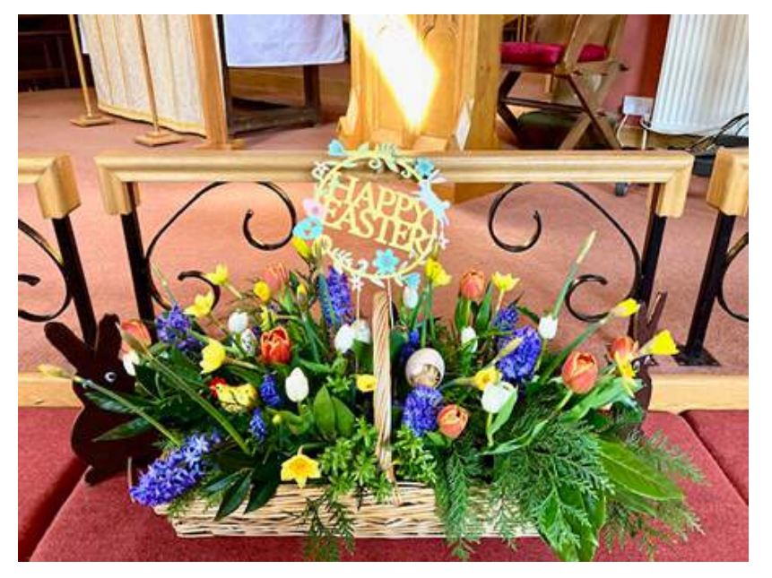
A huge thank you to one and all who have contributed to the past year's floral activities.