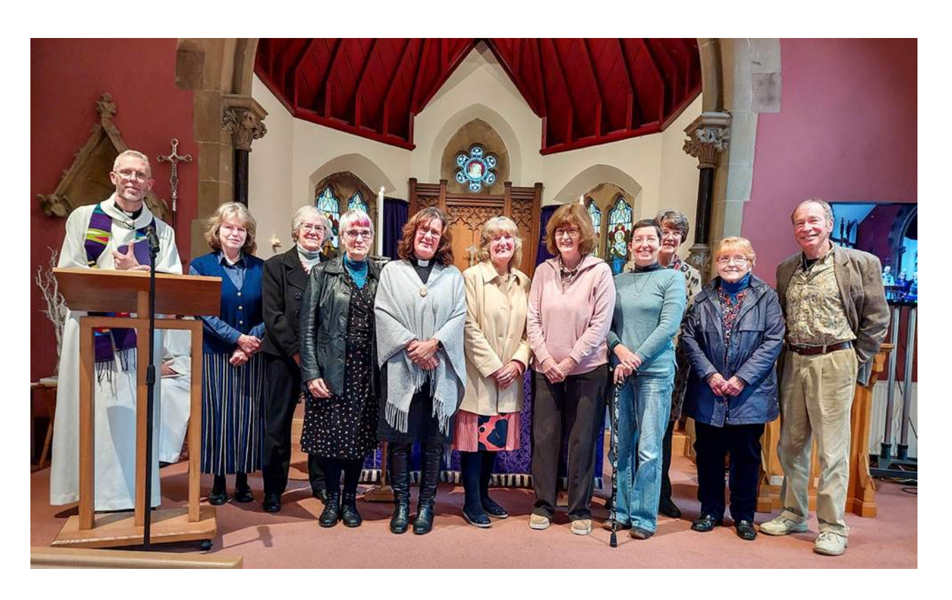
St. Andrew's Listening & Prayer Team