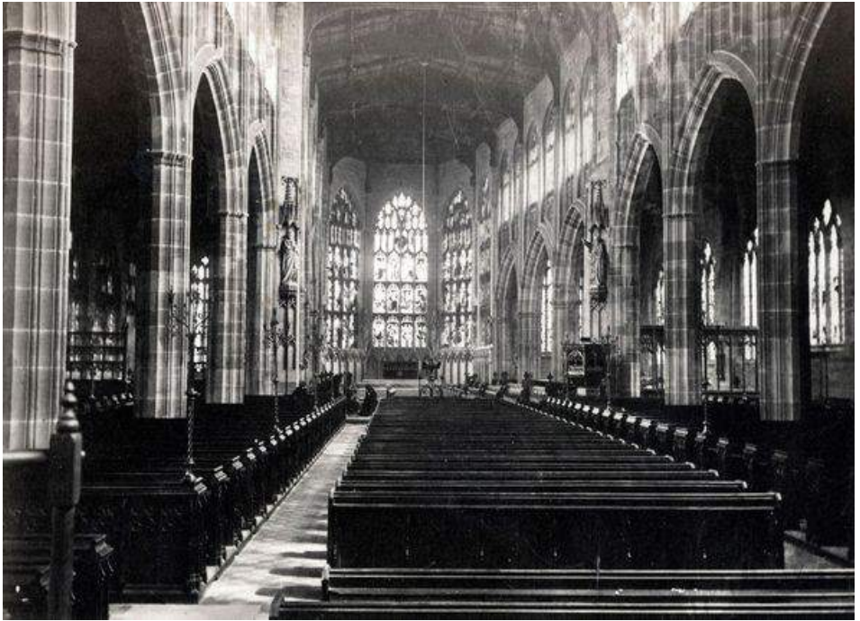
Coventry Cathedral—before and now!