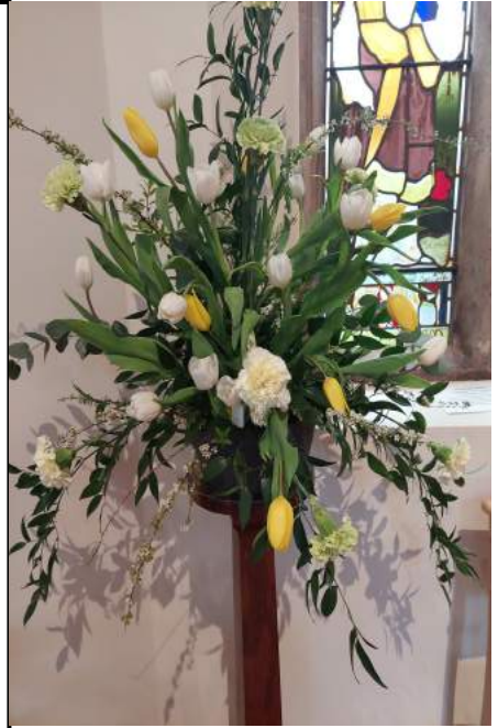
Another of our glorious Easter arrangements.